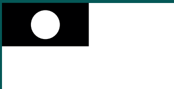
The Flag of Majlis Ansarullah

The Majlis shall purely be a religious organisation having no political interests whatsoever.